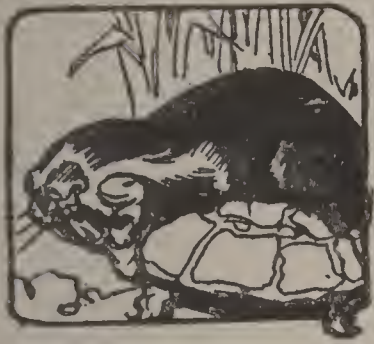
The Two Started a Store.

“I’VE told you, children,” I said daddy, “how a little mole, who had got even with old Farmer Hicky for plowing off the heads of his children, had escaped from the farmer’s angry hands to his friend, Mr.